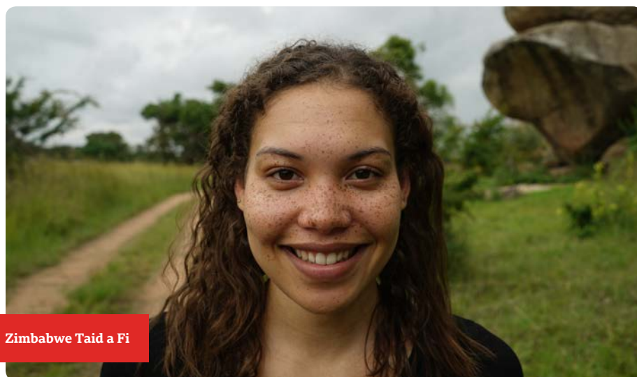
Zimbabwe Taid a Fi