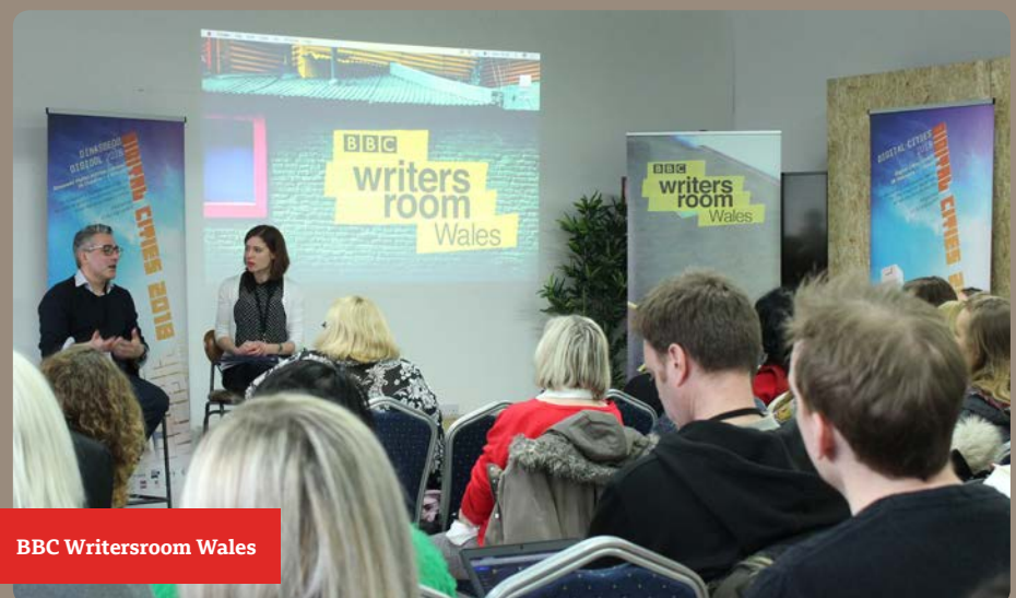
BBC Writersroom Wales