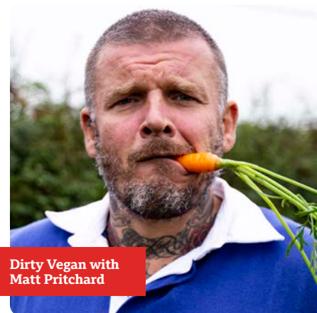
Dirty Vegan with Matt Pritchard

This year saw a focus on younger audiences in drama and comedy as well as in factual with content such as Dirty Vegan , Hayley , and Help! We're Having a Baby .