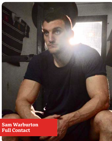
Sam Warburton Full Contact

The Wales Women's football team's bid to make it to the 2019 World Cup captured the imagination. An audience of 1.1 million watched on BBC 2 across the UK as the team missed out at the final hurdle in a defeat by England at Rodney Parade.