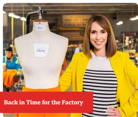
Back in Time for the Factory

Elsewhere, some of the BBC's most prestigious musical output is centred in Wales. This year it included BBC Young Musician – a competition which has developed a reputation for finding the superstars of the future – whilst Colwyn Bay played host to the BBC Proms in the Park Wales, a cultural highlight of the year.